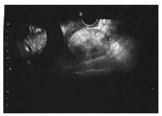
Fig. 1. Ultrasound sonography of metastatic ovarian tumor The vaginal ultrasonography demonstrated a 6.6\times4.4 cm (approx.) hypoechoic lesion of the left ovarian tumor.

The physical examination on admission was normal and fetal growth was consistent with gestational age. AST (40IU/ml) and LDH (835IU/ml) were elevated. The serum levels of CEA, CA19-9, and CA125 were 369.4ng/ml, 7730U/ml and 141U/ml respectively. Because of a positive fecal occult blood test, an upper gastrointestinal endoscopy and a lower gastrointestinal endoscopy were performed. The colonoscopy revealed, at 20cm depth, an ulcerated mass in the sigmoid colon (Fig. 4). Biopsies were taken and the histopathological examination showed adenocarcinoma of the sigmoid colon. The ovarian